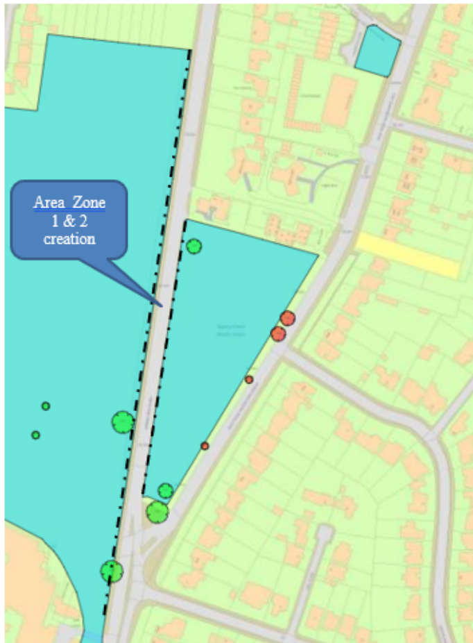
Map C Epp New Road Reeds Forest 32